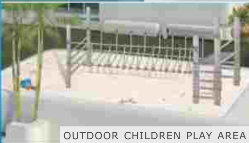
OUTDOOR CHILDREN PLAY AREA