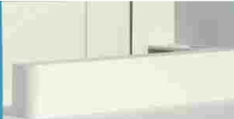
OPEN AIR BAR BE QUE

Share unforgettable memories with family and friends.